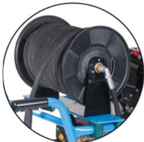
Optional 40m Hose Reel Available

For maximum performance and outstanding longevity at the heart of the Evolution 3 petrol you will find a world leading Interpump 1450 Rpm triplex plunger pump driven via a 2:1 reduction gearbox and ultra reliable Honda engine.