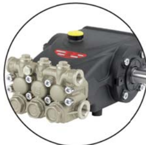
Interpump 59 Series