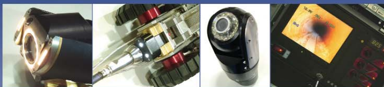
ZOOM CAMERA BACK VIEW CAMERA TILT & ROTATE CAMERA CONTROL UNIT

This Pipeline Inspection Color Television System is designed for internal pipe inspection of sewer lines, water mains and utility ducts. The basic system has camera, lighthead and cabling capability for 5" thru 24" diameter lines up to 1,000' long working manhole to manhole. High resolution camera module and high intensity lighting let you see details that other cameras miss. Brushless drive motors and electronic clutches in the tractor yield longer life, less maintenance and maximum power in a minimum size.